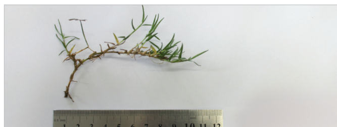
Fig 3. close-up of live stolon